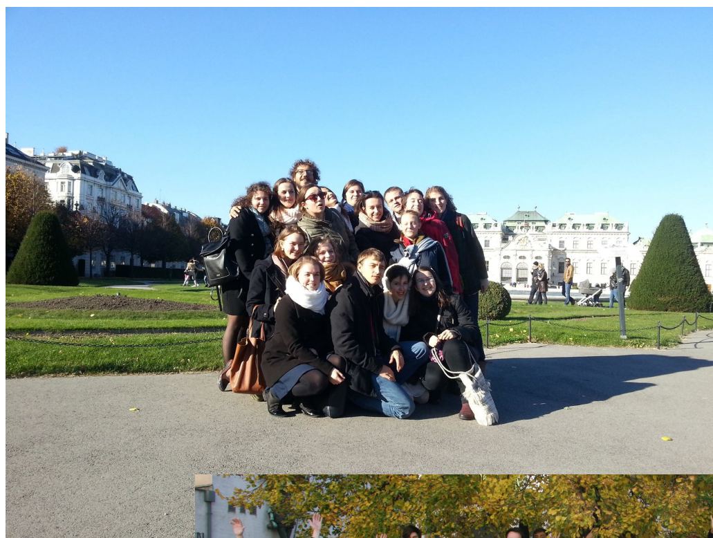
Sightseeing in Vienna.