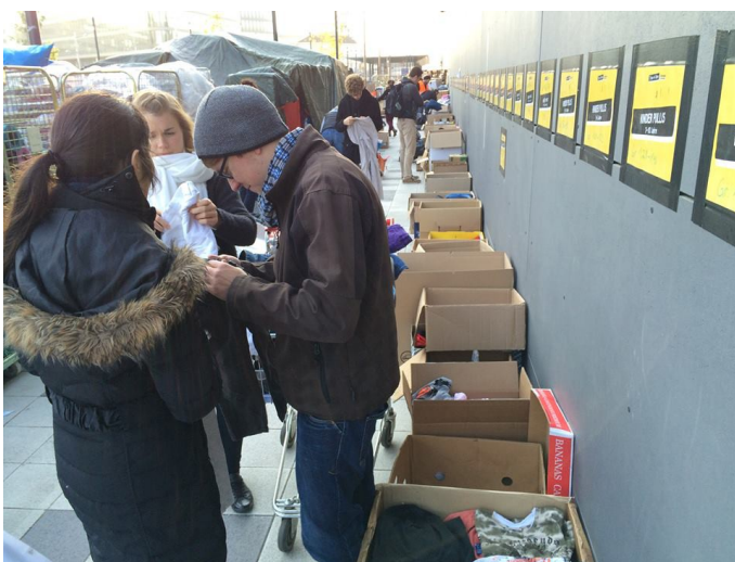
At the main railway station Wien Hauptbahnhof.