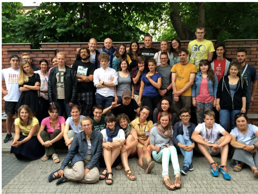
Photo: volunteers in Częstochowa

The second meeting was happening since October 30 th until November 1 st in a beautiful city of Vienna, Austria and it welcomed more than 70 participants from 13 countries. The family is growing!