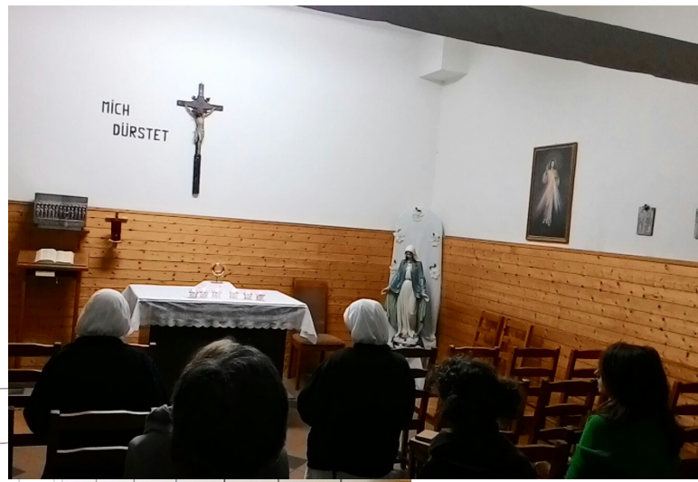
Helping in the house of the Missionaries of Charity.