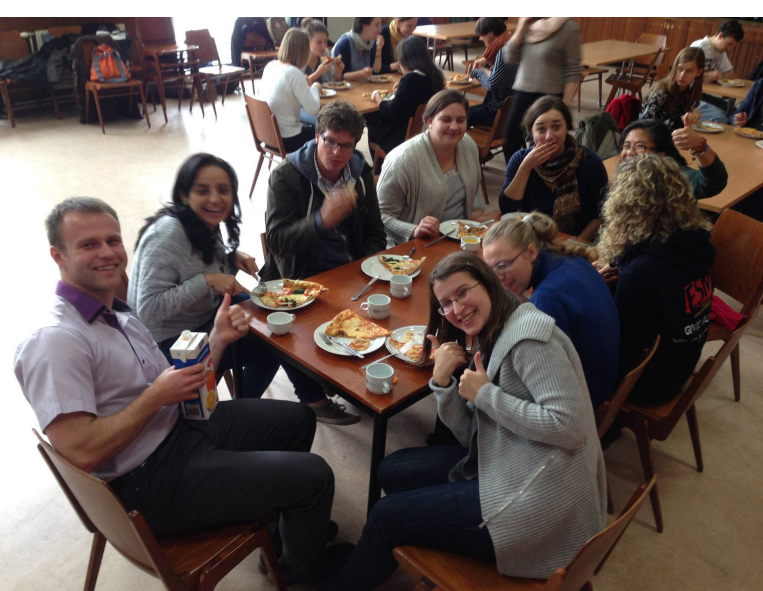
Sharing meals is also a way to build bridges :)