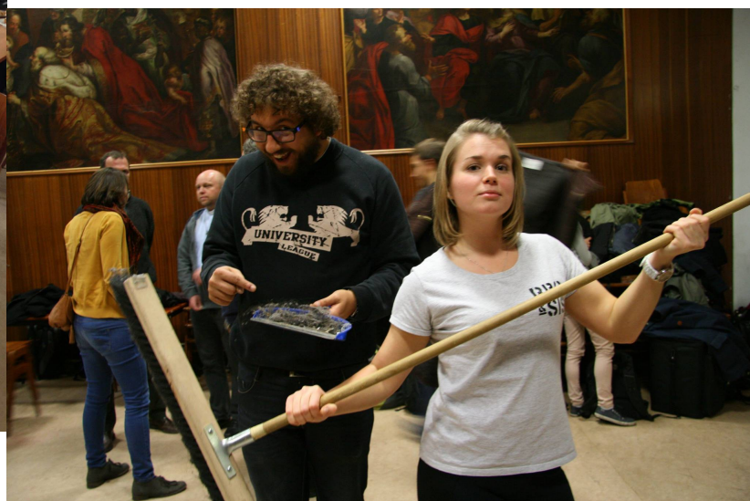
Cleaning can be fun when you do it together :)