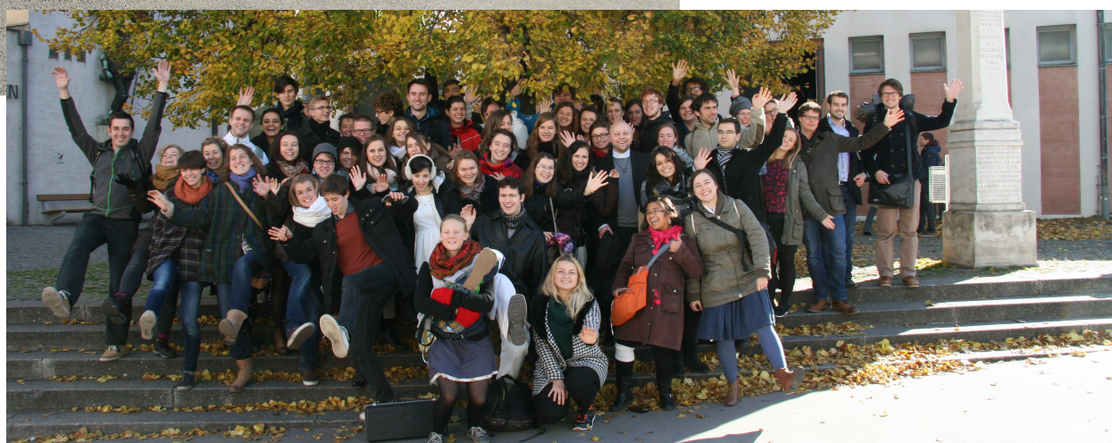
Group photo :)

The weekend has finished with the celebration of the Holy Mass singing together the hymn of the WYD Krakow.